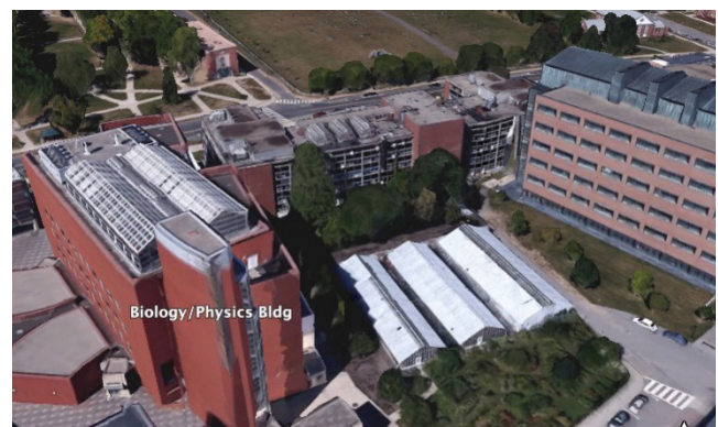
Google Earth image of the BPB Greenhouse complex on the rooftop of the Biology Physics Building and the TLS Greenhouse complex on the ground.

The Conservatory Collection in TLS is the most diverse of any collection at a public institution in the Northeast, and one of the three most diverse collections at an academic institution nationally. Nearly 6,000 individual plants representing 2,700+ species offer a living library of nearly 1% of global plant diversity from across the plant tree of life.