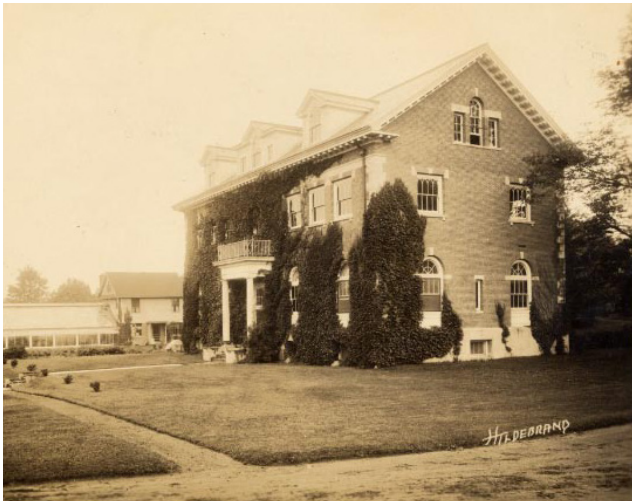
Note greenhouses next to the Budds Building, circa 1924.